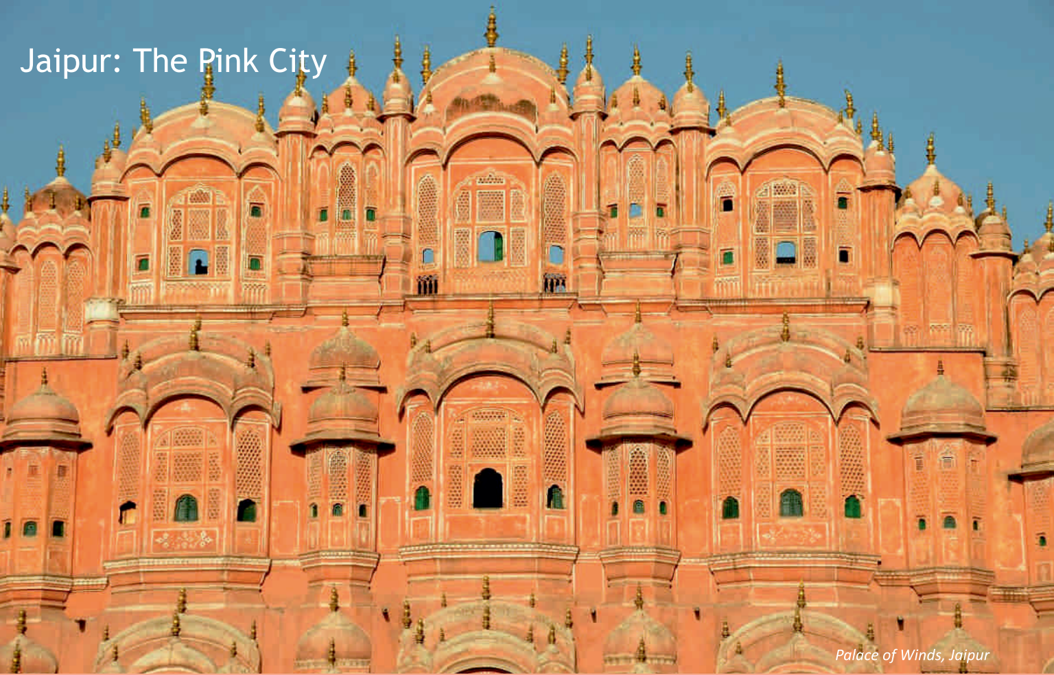
Palace of Winds, Jaipur

Pink City Jaipur is the ideal location for this impressive learning and cultural experience. It is one of the most literate areas of India's northern plains and one of the most industrious parts of the country. Known for its historical buildings, breathtaking architectural symmetry and the right mix of a modernity and tradition, makes Jaipur the most apt choice.