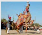
Pushkar: Camel Safari