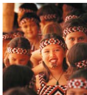
Experience some of the New Zealand culture by joining activities programmes