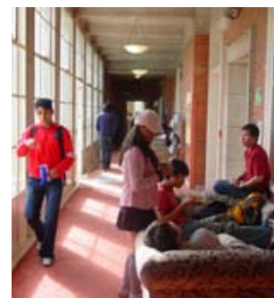
Interior of the school