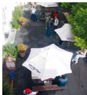
Patio area at the back of the school