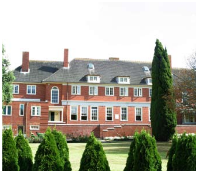
Kaplan Aspect Auckland

The Auckland school is located in one of the city's most popular areas between the Domain, a beautiful public park, and the lively Newmarket district, with its chic shops, bars and cafes. It is also just a 5 minute walk from Parnell Village with its unique colonial atmosphere.