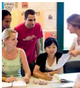
Kaplan Aspect teacher and students

Students can join the local gym for indoor sports and fitness training.