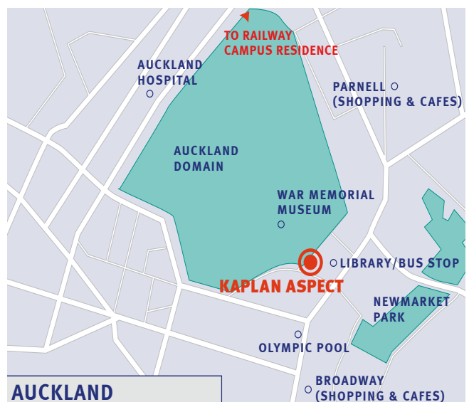
Kaplan Aspect Auckland Pearson House Parnell Auckland New Zealand