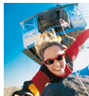
Kaplan Aspect student activities