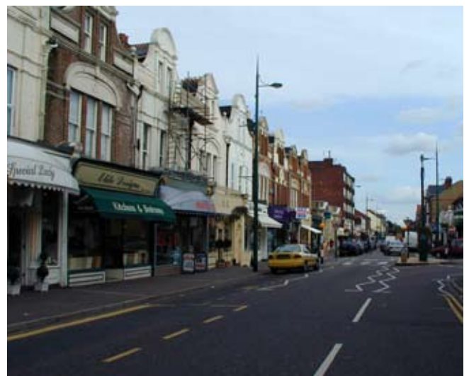
The seaside town of Bournemouth

Bank Apartment 129 Poole Road Westbourne Bournemouth BH4 9BG United Kingdom