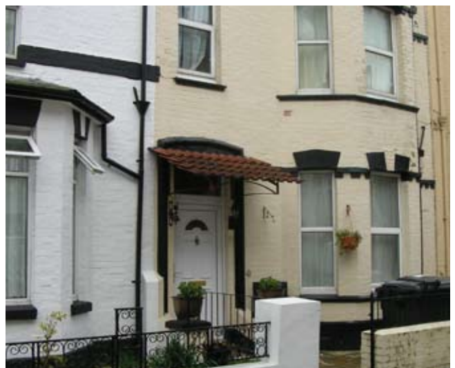
Entrance to Purbeck apartments

Purbeck Apartments 17 Purbeck Road Bournemouth BH2 5EF United Kingdom