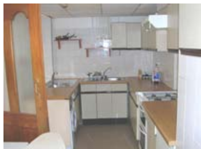
Fully equipped communal kitchen