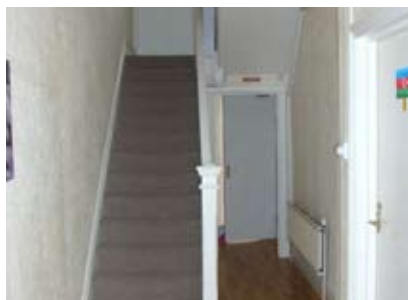
Apartment entrance hall