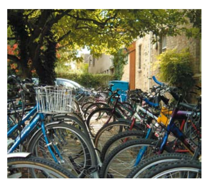
Many bikes in Cambridge

Approximately every 30 minutes. Journey time: 30 minutes