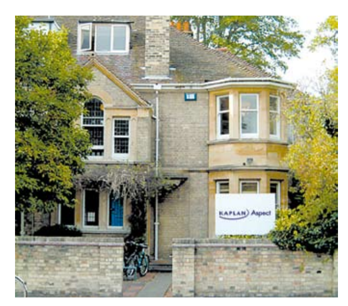
Kaplan Aspect Cambridge

Founded in the late 1970's, Kaplan Aspect Cambridge is housed in a large, converted Edwardian house with a modern extension. The school is west of the city centre in the quiet, residential area of Newnham, a 10-minute bus ride away from the centre. The school has its own gardens where we hold barbecues on warm summer evenings.