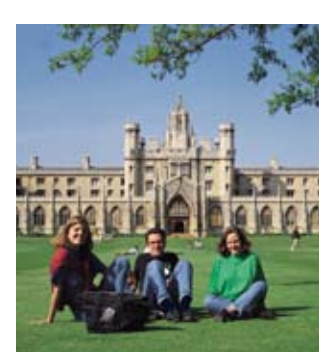
Kaplan Aspect students