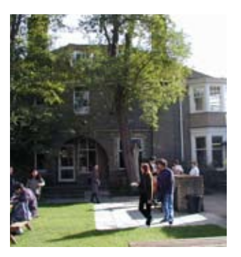
The school garden area