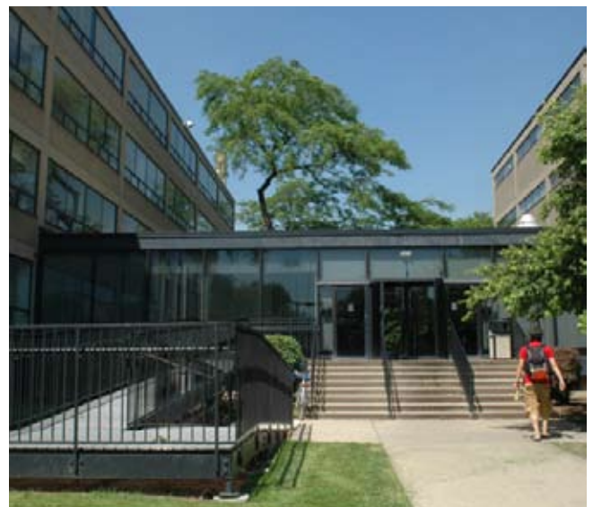
Kaplan Aspect Chicago on the campus of the Illinois Institute of Technology

Kaplan Aspect Chicago IIT is located on the Illinois Institute of Technology campus, which is just a short train ride from downtown Chicago. Students have full use of IIT's facilities including access to the Galvin Library, Keating Sports Center and Recreation Center. IIT is a private, PhD granting university, with programmes in engineering, science, psychology, architecture, business, design and law. Kaplan Aspect is located on IIT's urban campus in a modern building designed by Mies Van der Rohe.