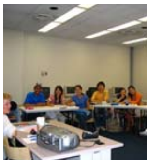
Kaplan Aspect Multimedia room

Chicago provides visitors with many big-city recreational opportunities. Watch the famous Chicago Bulls Basketball team or stroll the shores of Lake Michigan. Chicago's cultural scene is packed with hundreds of shows, exhibits, festivals and special events including a Frank Lloyd Wright architectural tour.