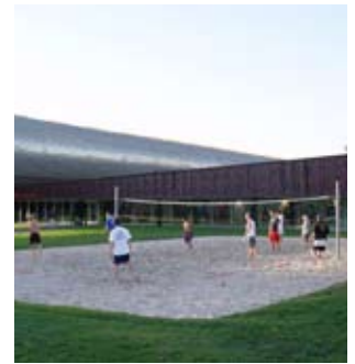
Beach volleyball court on campus