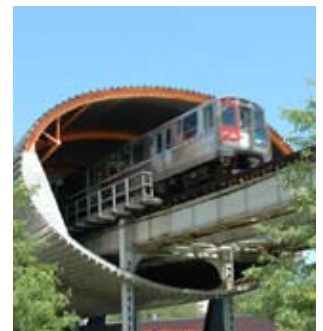
Sky train from the McCormick Tribune Campus Center