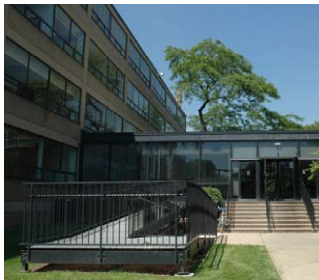
Kaplan Aspect at IIT

If there are any other changes to the student's arrival or if they have any problems, they should contact the school at +1 312 560 0908, and be prepared to tell them their name, the school name (Kaplan Aspect Chicago) and location.