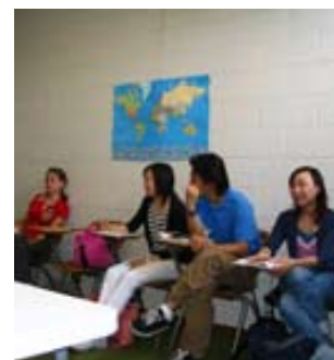
Kaplan Aspect classroom