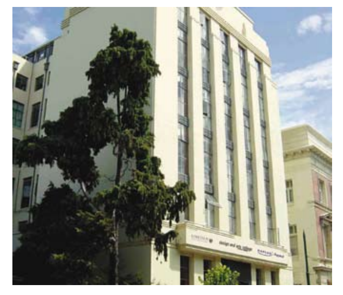
Kaplan Aspect Christchurch

Kaplan Aspect Christchurch is ideally situated in the city centre next to Cathedral Square and within a moment's walk from cafes, bars, shops, libraries and central bus routes.