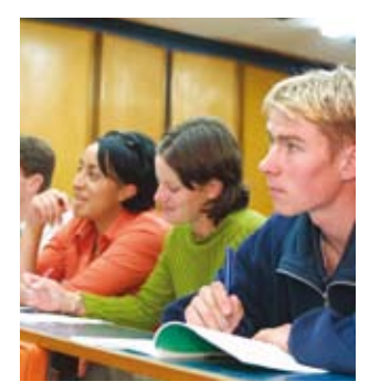
Students in the classroom

$2.50 (2 hours of travel) $3.80 (1 day) $19.00 (1 week)