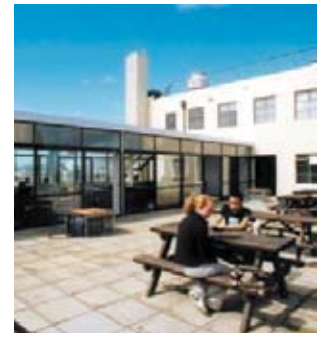
The roof-top café