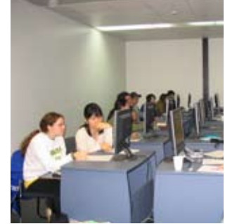
Kaplan Aspect teacher and students