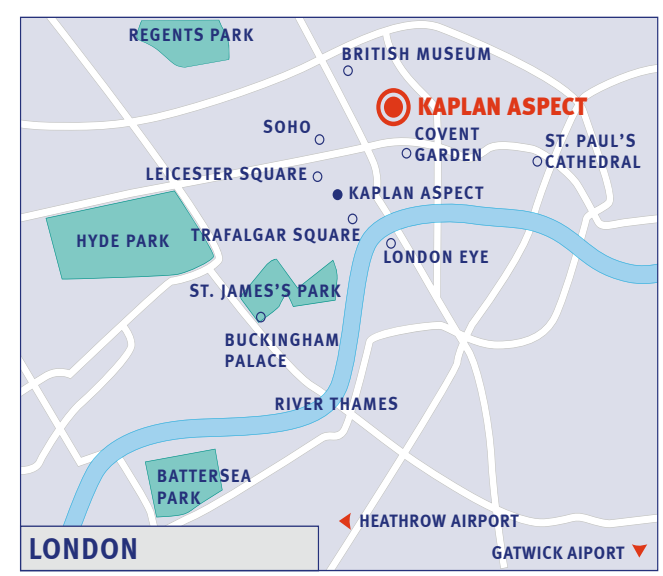
Kaplan Aspect London 3 - 4 Southampton Place London WC1A 2DA United Kingdom