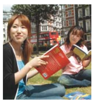
Kaplan Aspect students