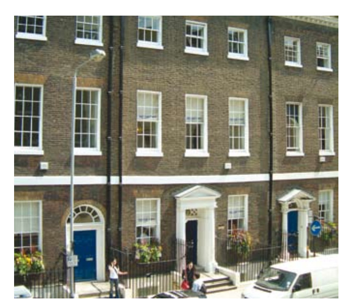
Kaplan Aspect London

Kaplan Aspect London is situated in a historic, listed building dating from the 18th century which has been fully refurbished and modernised. Located just a 5 minute walk from Covent Garden, the school really is in the heart of London.