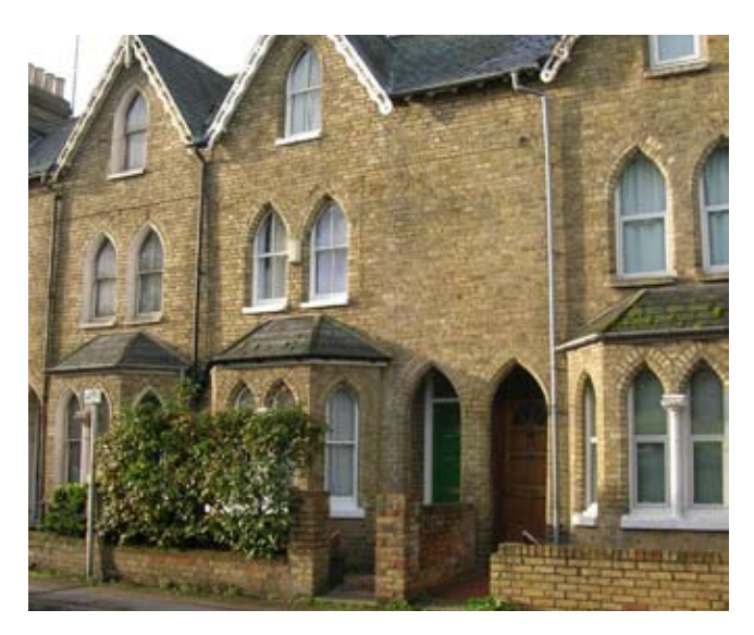
One of the St. Clements

St. Clements Apartments 2 Glebe Street Oxford OX4 1DQ United Kingdom