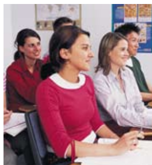
Kaplan Aspect students in the classroom

Our full time Social Organiser helps ensure that students get as much out of their stay in Oxford as possible. We regularly survey our students to make sure that we offer the programmes you want!