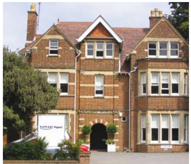
Kaplan Aspect Oxford

Kaplan Aspect Oxford is housed in an attractive Edwardian building with 3 floors and a modern, prize winning extension. The school is situated just 10 minutes north of Oxford's city centre and has a beautiful garden and courtyard at the back of the building: the perfect area for summer barbeques and sporting activities.