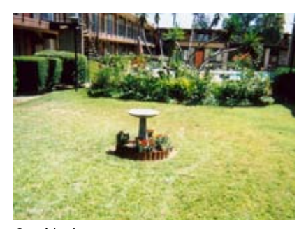
Outside the apartments