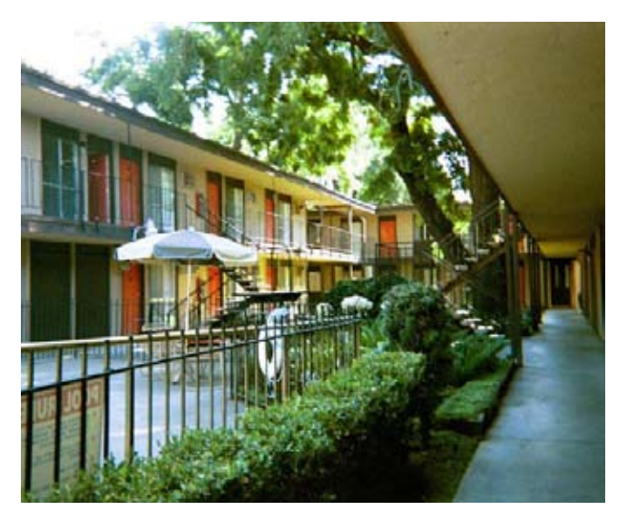
Outside the apartments