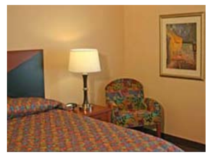
Belltown Inn bedroom