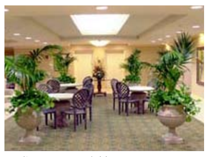
Mediterranean Inn lobby