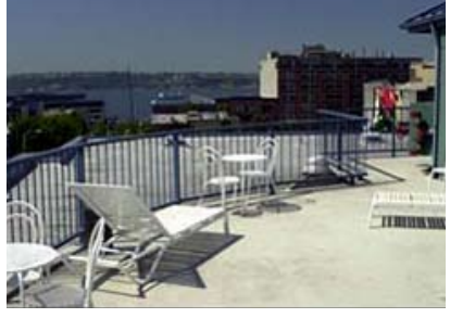
Belltown Inn public deck

There is a private bathroom in each suite with a tub, shower, sink and toilet.