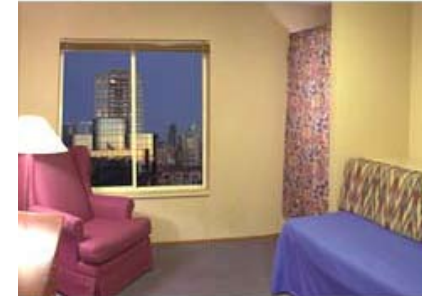
Vermont Inn room