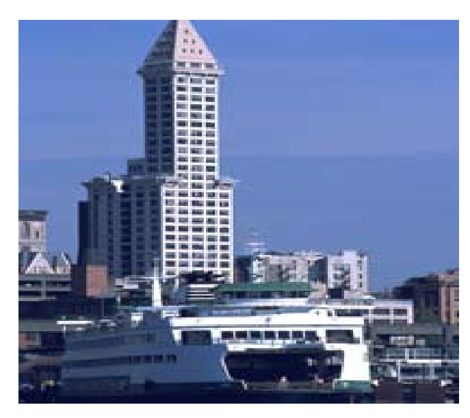
Ferry and Smith Tower

To get to Seattle Kaplan Aspect from the airport, take bus number 194 to downtown (4th ave/Jackson) and transfer to route 71 towards the University District. The bus route will take you directly to the Kaplan Aspect School at 4216 University Way NE.