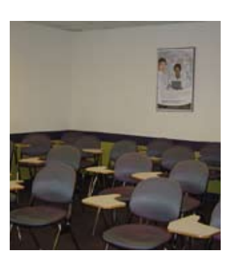
Kaplan Aspect classroom