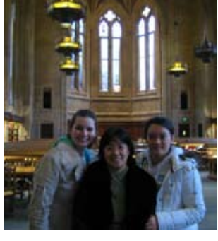
Kaplan Aspect students in Seattle UW library