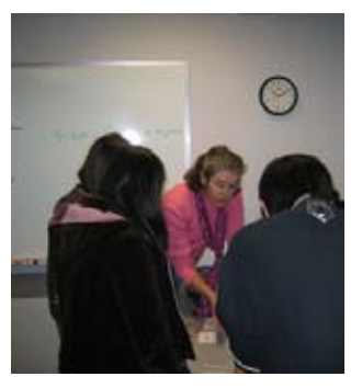
Kaplan Aspect Teacher with students