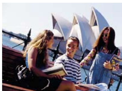
Kaplan Aspect students