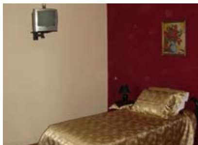
Basic City Apartment bedroom