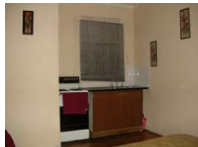
Kitchen in a twin studio room