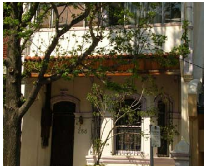
Basic City Apartments