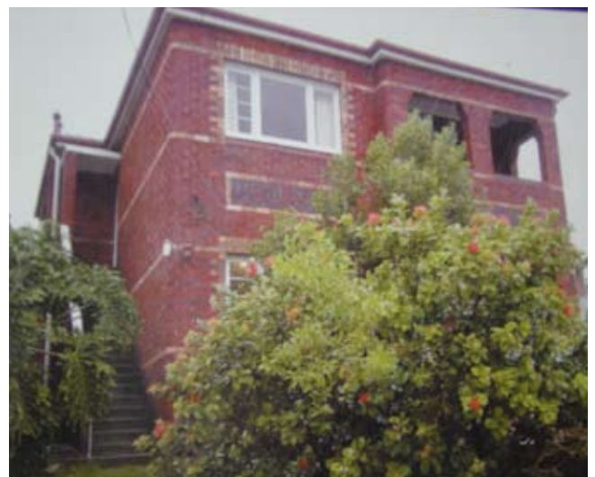
North Bondi Apartment exterior