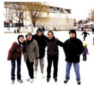
Students during the free time activities