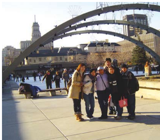
Students in Toronto

Taxi services costs approximately $40 - 60 (+ 10-15% gratuity) to get to your home stay or downtown. The drive averages about 45 minutes.