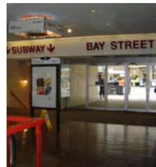
Subway in Toronto