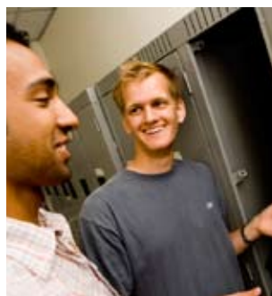
Kaplan Aspect students

There are numerous places of worship in the surrounding areas of the school.