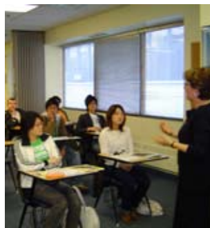
Kaplan Aspect teacher and students in the classroom

From the school, students can easily explore all attractions in Toronto on foot or by subway. Kaplan Aspect arranges a full schedule of excursions and activities including weekend trips to Montreal and Niagara Falls. There are also visits to the Toronto Zoo and the Art Gallery. Toronto has a lot of professional sports teams so students can purchase tickets to see games as well.