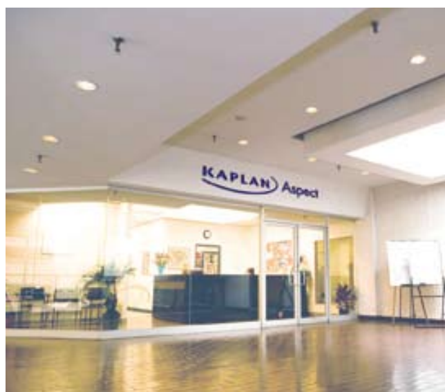
Kaplan Aspect Toronto

Kaplan Aspect Schools in Canada are accredited members of the Canadian Association of Private Language Schools (CAPLS)