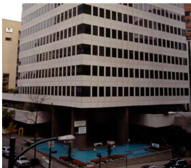
Kaplan Aspect Vancouver

Kaplan Aspect Schools in Canada are accredited members of the Canadian Association of Private Language Schools (CAPLS)