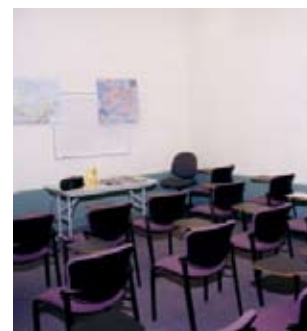
Kaplan Aspect classroom