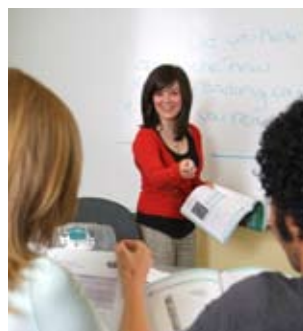
Teacher and students

There are numerous places of worship in the areas surrounding the school.