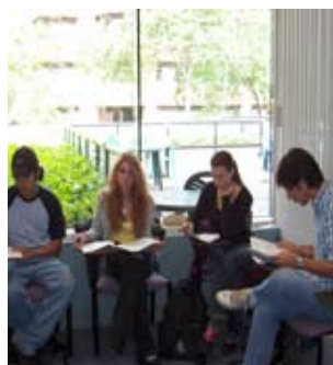
Kaplan Aspect students in the classroom

From the school, students can easily explore all of Vancouver's attractions on foot or by subway/ bus. Kaplan Aspect arranges a full schedule of excursions and activities, including day and night skiing at nearby Whistler Mountain and Grouse Mountain in winter and hiking or white water rafting in summer.